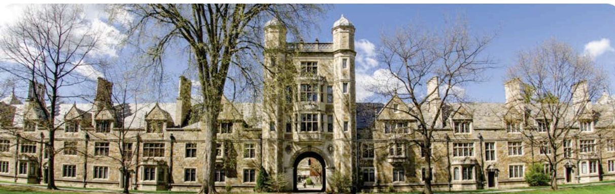
University of Michigan | Ann Arbor, Michigan