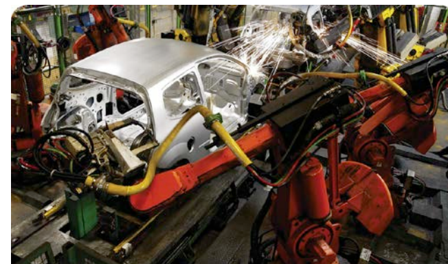
Automotive Line | Detroit, Michigan