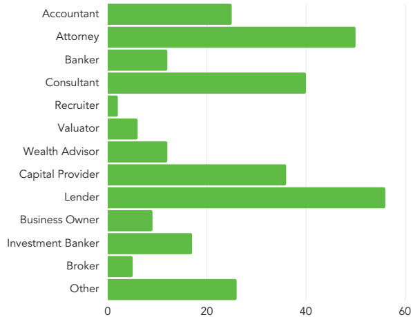
MEMBERS BY TITLE