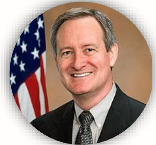
Senator Mike Crapo (R-ID) Chair