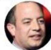
Reince Priebus Appointed