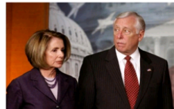
Left: Nancy Pelosi (House of Representatives), Right: Steny Hoyer (Minority Whip)