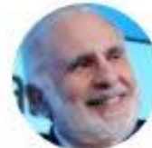
Carl Icahn Appointed