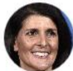
Nikki R. Haley