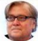
Stephen K. Bannon Appointed