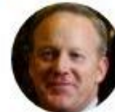
Sean Spicer Appointed