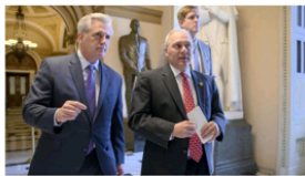
Left: Kevin McCarthy (House of Representatives), Right: Steve Scalise (Majority Whip)