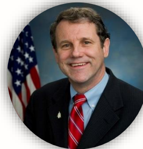
Senator Sherrod Brown (D-OH) Ranking