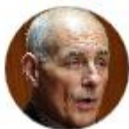
John F. Kelly