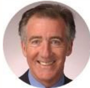
Rep. Richard Neal (D-MA) Ranking Member