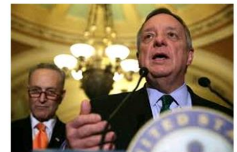
Left to right: Minority Leader Rep. Chuck Schumer (D-NY) and Minority Whip Rep. Dick Durbin (D-IL)