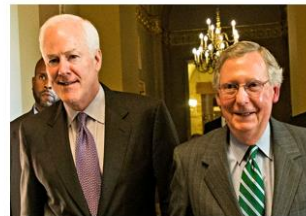
Left to right: Majority Whip Rep. John Cornyn (R-TX) and Majority Leader Rep. Mitch McConnell (R-KY)