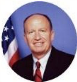
Rep. Kevin Brady (R-TX)