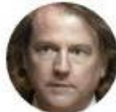
Donald F. McGahn II Appointed