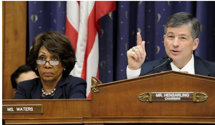
Rep. Maxine Waters (D-CA) Ranking