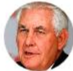
Rex W. Tillerson