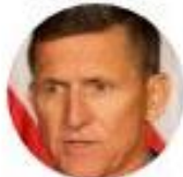
Michael T. Flynn Appointed