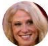
Kellyanne Conway Appointed