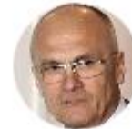
Andrew F. Puzder