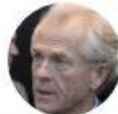
Peter Navarro Appointed