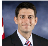
Rep. Paul Ryan (R-WI)