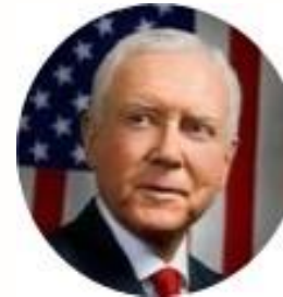
Rep. Orrin G. Hatch (R-UT) Chair