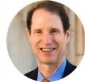
Rep. Ron Wyden (D-OR) Ranking