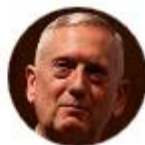
James N. Mattis