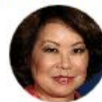
Elaine L. Chao