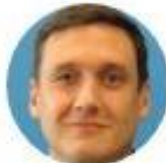
Thomas P. Bossert Appointed